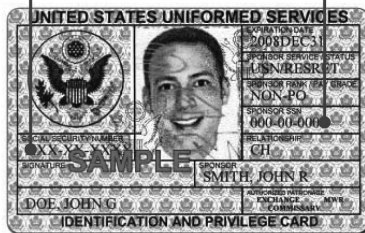
DD Form 1173-1