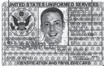
DD Form 1173-1