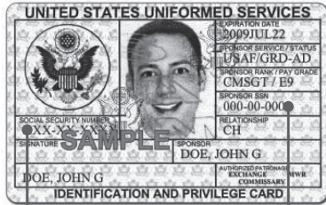
DD Form 1173